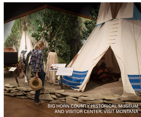
BIG HORN COUNTY HISTORICAL MUSEUM AND VISITOR CENTER, VISIT MONTANA

435 Interstate 94 Business • Miles City, MT 59301 Gain a glimpse of the Old West at this heritage center-turned-museum, with an eclectic assortment of farm tools, historic photographs, an impressive barbed wire display and one of the nation's premier arrowhead collections, plus an entire building dedicated to the weaponry of one donor—including some pre-revolution pieces. rangeridersmuseum.com