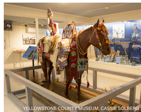
YELLOWSTONE COUNTY MUSEUM, CASSIE SOLBERG

112 Orgain Ave. • Wibaux, MT 59353 Enjoy the historic walking tour of the Wibaux Business District, Old St. Peter's Catholic Church and the Pierre Wibaux Statue. Wibaux was the world's largest cattle rancher in the late 1800s, who had his French gardener craft a meticulous garden oasis of vibrant flora and a grotto crafted of agate, petrified wood and lava. The grounds provide a perfect picnic spot. visitmt.com/listings/general/museum/wibaux-museum.html